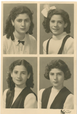
From Vies possibles et imaginaires , by Yasmine Eid-Sabbagh and Rozenn Quéré, 2012.