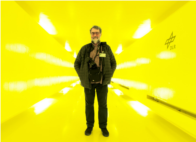
Joan Fontcuberta