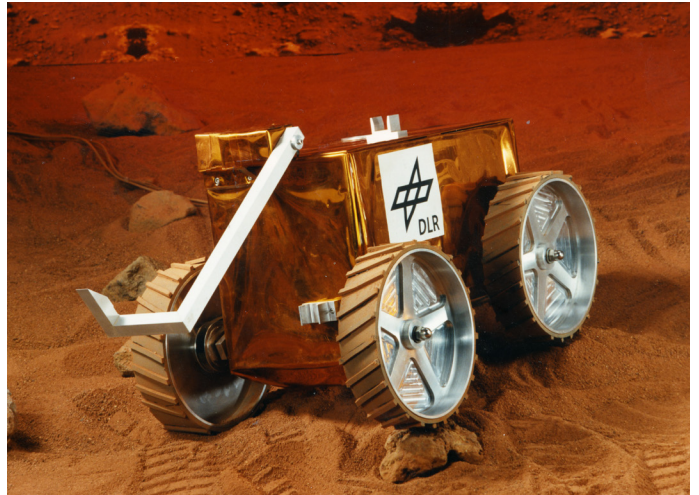
Mars Rover Survey, 1995.

Spanish artist Joan Fontcuberta (*1955 in Barcelona/Spain) deals with humanity's great topics, nature and technology for example, in his artistic and theoretical output. In his works he creates a visual universe, in which truth and fiction are closely interwoven. In the early series, Sputnik (1997), which was distinguished with the Hasselblad Award in 2015, Fontcuberta was already playing with the longings and visions that humans associate with the idea of travelling through space.