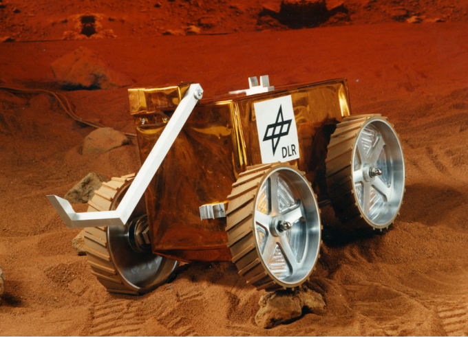
Joan Fontcuberta