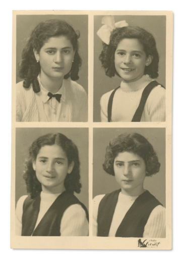
From Vies possibles et imaginaires , by Yasmine Eid-Sabbagh and Rozenn Quéré, 2012.

Yasmine Eid-Sabbagh and the Historical Photographic Archive of the Rautenstrauch-Joest-Museum