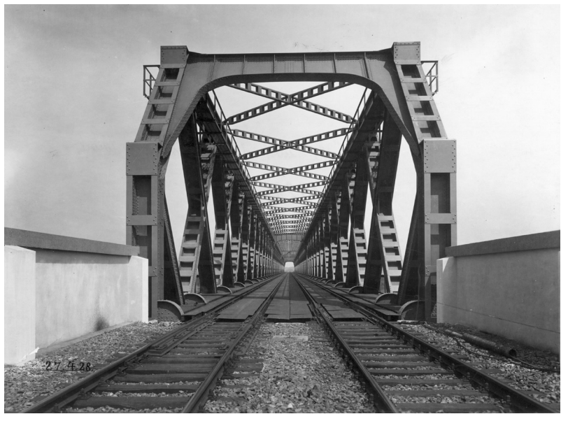
Motif from the RWWA / Railway Bridge Across the Rhine at Wesel (1928) (stock Abt. 130 Gutehoffnungshütte Aktienverein, Oberhausen)

The work of Brazilian artist Rosângela Rennó (*1962 in Belo Horizonte/Brazil) is characterized by dealing with discarded pictures which she finds on flea markets across the world, or with found image material from private and public archives or newspapers. The subject under investigation in Rennó's many years of work is the relationship between remembering and forgetting. Along the way, she critically examines Brazil's past and investigatively teases hidden information out of images held in folksy photographic collections.